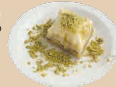
Baklava with Pistachio