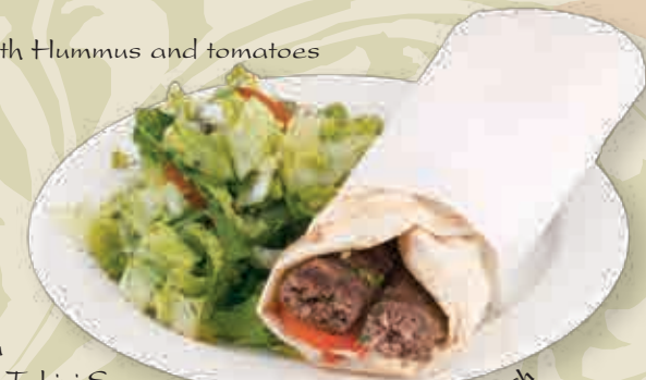
Koufta Kebab Sandwich