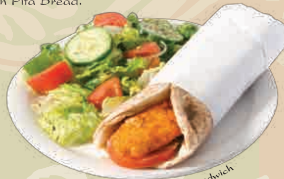
Chicken Kebab Sandwich