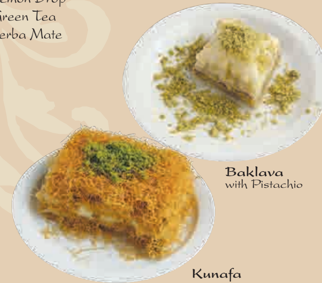
Baklava with Pistachio