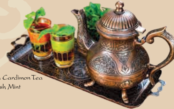
Arabian Cardimon Tea with Fresh Mint